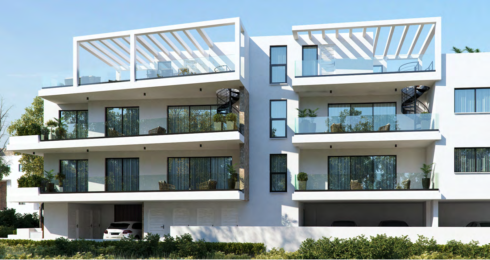
First & Second Floor